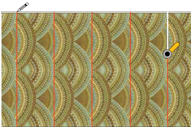
Bloomington Lap Border: Cut 4 repeat segments