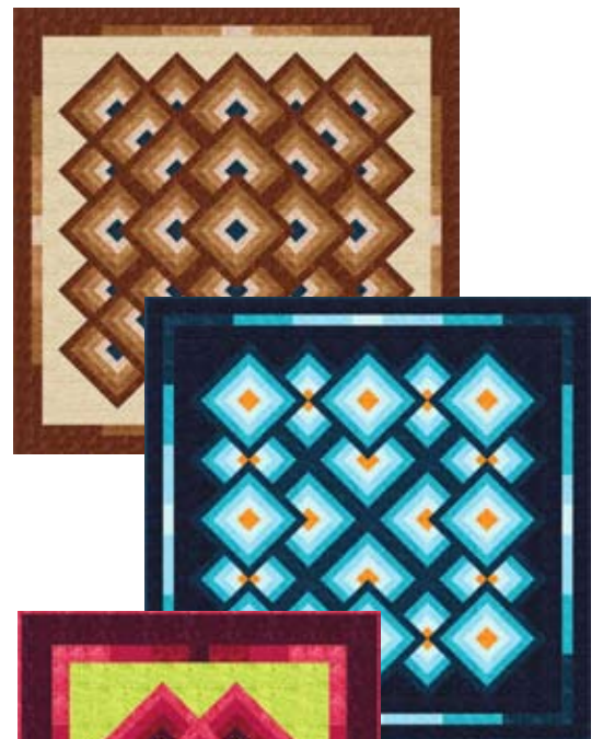
52 x 74 Sherbet Color Way

Featuring fabrics from the Prisma Dye collection from Artisan Batiks. This dynamic pattern includes instructions for two sizes 52 x 74 and 85 x 85 inch quilt. Changing colors combinations or rotating blocks give this design unlimited possibilities! The pattern is sure to become a favorite among quilters of all levels and backgrounds!